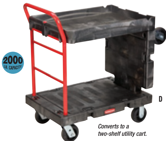
Converts to a two-shelf utility cart.