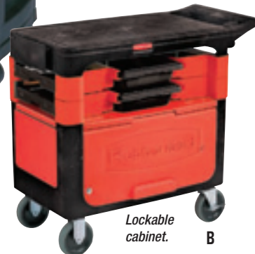
Lockable cabinet. B

Locking bar provides security and holds drawers in place.