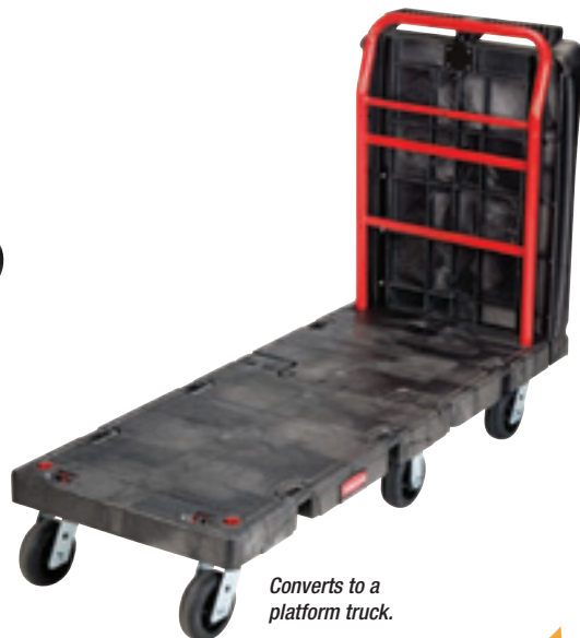
Converts to a platform truck.