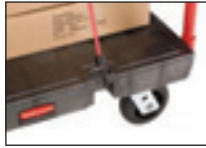
Molded-in tie down slots allow use of straps or bungees.