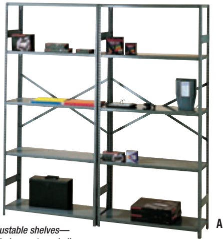
Adjustable shelves— includes posts and clips.